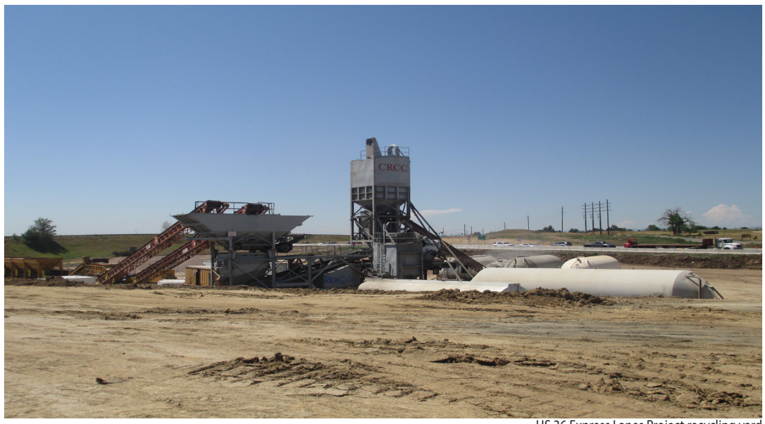
US 36 Express Lanes Project recycling yard