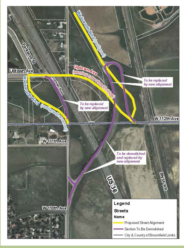
Illustration of new roadway alignment and old roadway to be demolished

As part of the US 36 Express Lanes Project, a three-week closure of Wadsworth Boulevard and 112th Avenue is required to connect the new Uptown Avenue bridge to the local streets. The closure will start in early September. The work includes construction of the embankment, curb and gutter, roadway and new signals at the two intersections.