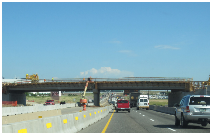
Uptown Avenue bridge girders

Demolition is complete on the US 36 bridge over West Flatiron Crossing on the eastbound US 36 side.