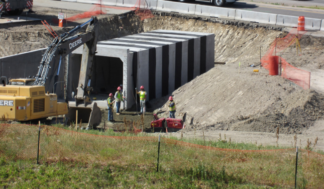
Box culvert installation for pedestrian underpass at Wadsworth Parkway

completion of the pedestrian underpass construction at